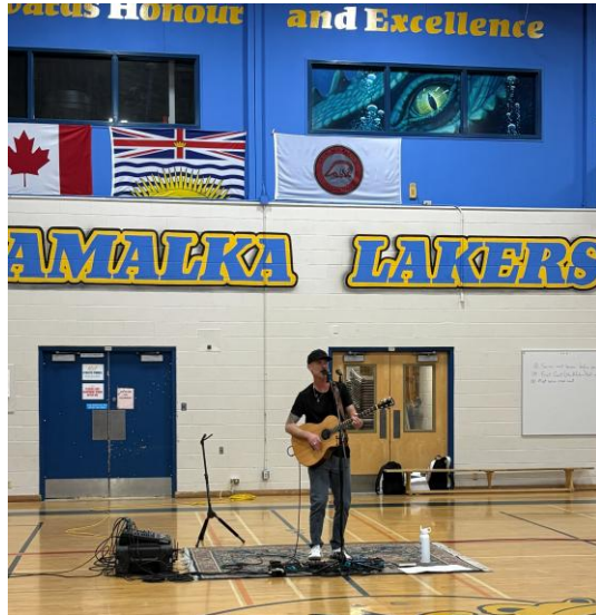
Kal Newsletter April 2026